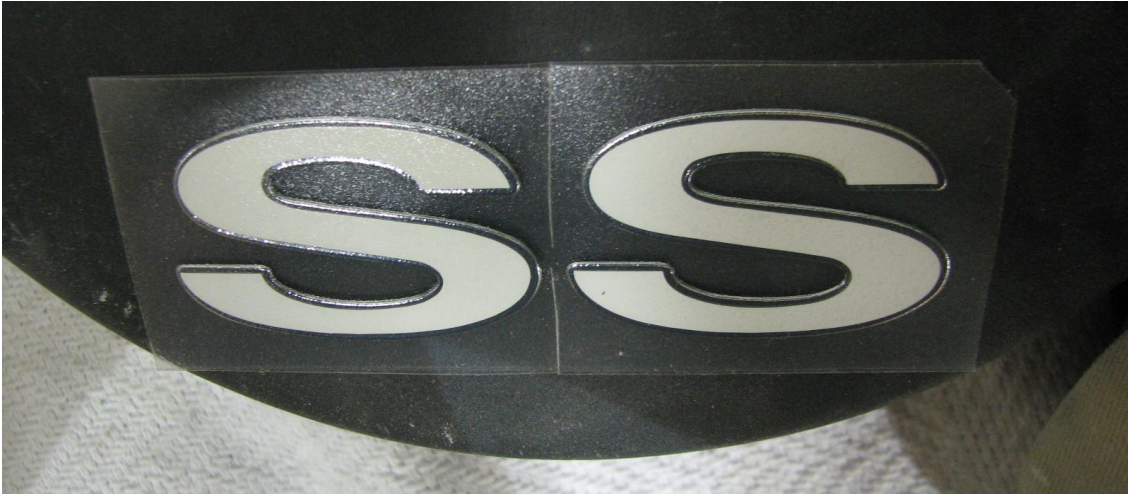
Figure 1: Slit cut in clear backings