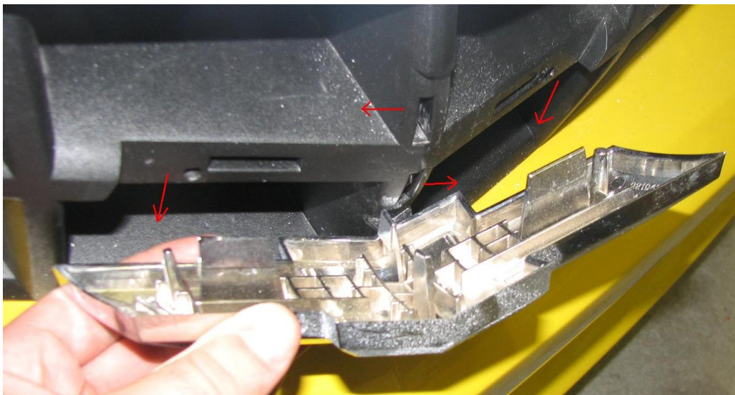
Figure 3: Removal of bowtie from vehicle