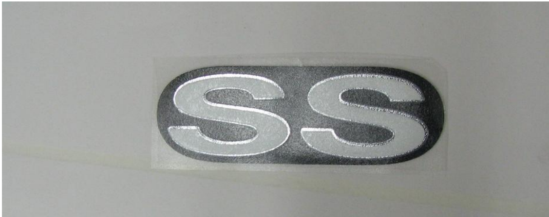
Figure 5: SS Badge on rear blackout plate