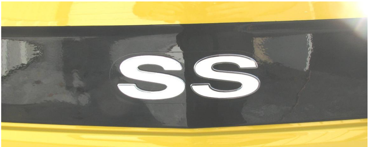
Figure 6: Finished installation of rear SS badge

*NOTE* The RS badges and grille insert installs the same way as the SS